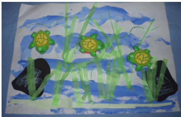
Turtle paint stamp template

This is the type of scenery /play mat the children can create.