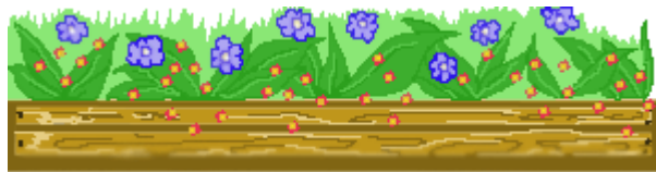
House window boxes