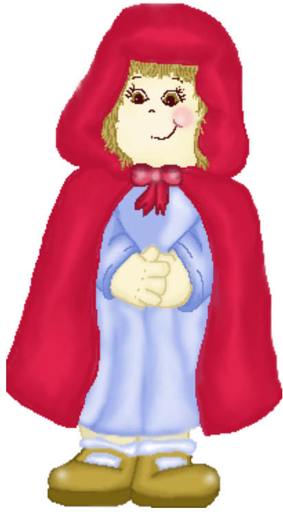
Little Red riding Hood